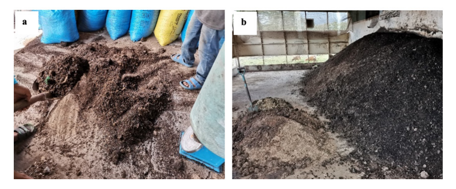
Figure 1. (a) Weighing and mixing of the feedstock; (b) Storing of the feedstock mixture for two weeks before bagging

The mixed SL and PM at a 3:1(w/w) ratio were used as raw feedstock. The mixture was stored inside the mixing area for two weeks to predecompose, allowing harmful gasses to volatilize. After two weeks, the mixture was bagged and piled inside the storage room, prepared for vermicompost loading.