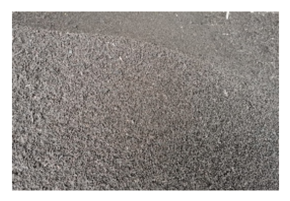
Figure 6. Sifted vermicompost to separate fully and partially vermicomposted feedstock

The physical property of the feedstock influences the rate at which it decomposes. Some of the physical features of resources are toughness, surface area, and particle size. For example, tough leaves are highly cuticularized compared to small and soft leaves that are readily compostable. Shredding the leaves reduces the particle size, increases its surface area, and exposes the hydrophobic waxy surface of leaves facilitating their ingestion by earthworms (PCAARRD, 2014). The matured vermicompost product was brownish-black, soft, had an earthy smell compared to the initial SL and PM feedstock. The recovered vermicompost was fine, and the original feedstock was already unidentifiable. The recovered vermicompost was processed adequately by earthworms (Sunil, 2016).