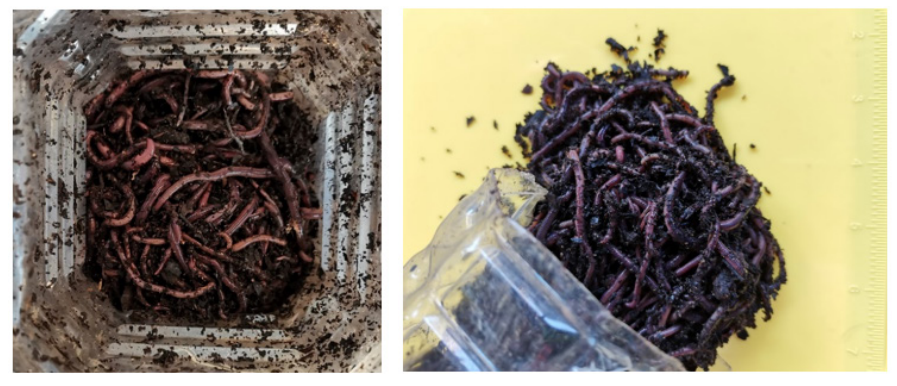
Figure 4. (a) Collected earthworms from the barrel; (b) Inspection of the biomass

One kilogram of Eudrilus eugeniae of about 1,000 earthworms was placed in all treatments with three replicates. The earthworms were counted and weighed to compare the change in population and biomass before and after the experiment (Figure 4). The total earthworm population was determined using the hand-sorting method (Ramnarain, Ansari, & Ori, 2019); (Zicsi, 1962).