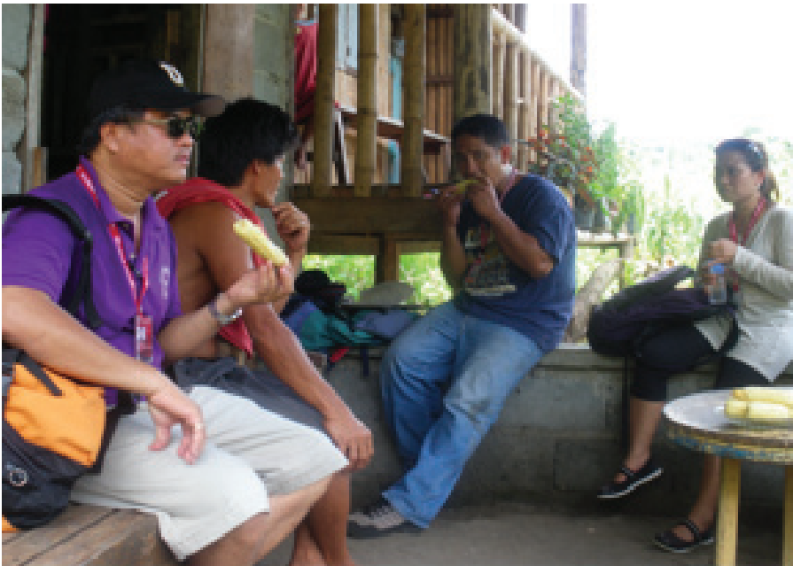
Figure 5. A farmer offers boiled young corn during the interview.

On the other side, the students noticed that despite their miserable and difficult situations, the households they had interviewed were very nice and hospitable to them (see Figure 5). They considered them very helpful, honest and compassionate which the students may perhaps have not expected from marginalized people who must have considerable discontentment and angst against society and the government. Given the available resources the community had, the students felt the strong will of families to feed their children and struggle for a better life, because despite the odds, they generally appeared to be happy (which is, of course, a trait that describes the adaptability and resiliency of Filipinos). One student commented that she “felt more blessed that I have all the things I need” because of what she saw in the community. She was disturbed that school age children had to stop or did not attend school because they had to assist their parents in the farm. Such emotional impact resulting from this exposure to social disparity is not only true to my students now because I heard this several times from my previous service-learning involvement (Oracion, 2002, 2009, 2010; see also Ligutom, 2009).