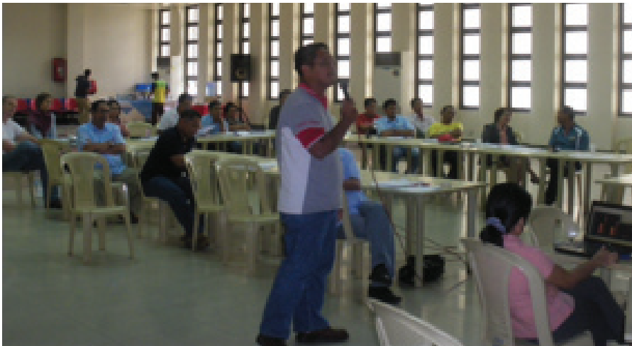
Figure 6. A graduate student presents the survey results to city government officials

Since service-learning engagement requires a host or recipient community and resources for the mobility of students, the partnership forged between an academe and a government unit or non-government organization is always vital for maximizing the use of resources and available opportunities (Figure 6). The environmental commitment of Bayawan City and the trust of its officials to the capacity of Silliman University faculty and students to undertake the monitoring of its waste management center became a facilitating factor for bringing our students for their service-learning engagement. The only retarding factor that I experienced, not only for this class but in my previous