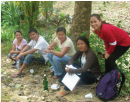
Figure 4a. The group rests after a long walk in search for households to interview

For the undergraduate students, it was a discovery and a realization of the kind of work that they may go into after graduation especially if they will be working with community projects. They became aware that fieldwork is not that easy because one has to travel and move around the community to meet people in order to understand the social problem under investigation. One mentioned the needed stamina for surviving a long hiking trip (Figure 4a). Moreover, they realized that an ability to interact with a diversity of people was important in order to generate quality data for a community program (Figure 4b). This ability includes being like the community people or appearing simple in the manner of dressing to avoid social gap that may restrict the flow of information. My American student, who took this principle seriously in fieldwork, went around interviewing without shoes because he saw many barefooted residents. He also