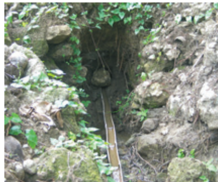
Figure 3b. Undeveloped spring