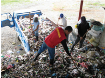
Figure 1a. Workers segregate plastic waste for recycling