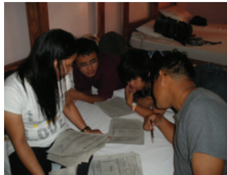
Figure 4b. The graduate students review the data of the undergraduate students