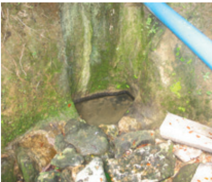
Figure 3a. Open dug-well