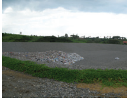
Figure 1b. The newly-opened sanitary landfill

The waste management center started its operation in the early part of 2010 and the concern of the city is how the leachate from the wastewater treatment facility will be monitored given the limited technical capacity of its personnel. The city government has no registered chemist who can conduct water monitoring and testing although it has available laboratory equipment for this purpose. Nonetheless, the monitoring and testing points within and around the waste management center as well as the areas where to collect water samples were identified. The water testing was conducted before and during the operation of the land fill to obtain baseline and annual data for determining the changes in water quality in surrounding areas. As already mentioned, the wastewater coming out from the waste management center also has to be secured to prevent contamination of the groundwater and other bodies of water surrounding the area, thus preventing water-borne diseases in the nearby communities.